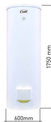
DHW option 300 l DHW tank