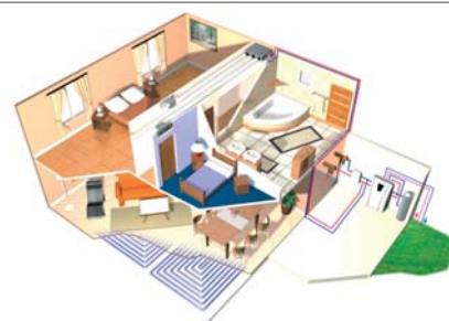
Mixed solution with heating-cooling floors downstairs and a Residenciat unit upstairs