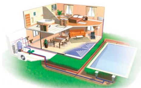
Cooling-heating floor downstairs, fan coil units or low temperature radiators upstairs, and swimming pool water heating